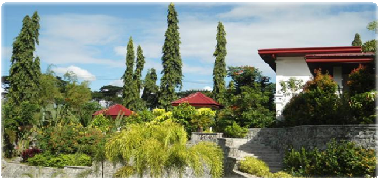
A partial view of De La Salle Retreat Center, Dasmariñas

The website will also provide more detailed information related to the Assembly.