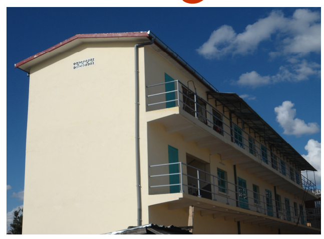
The new building of the Centre