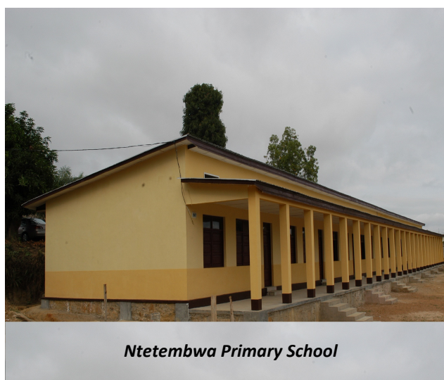
Ntetembwa Primary School