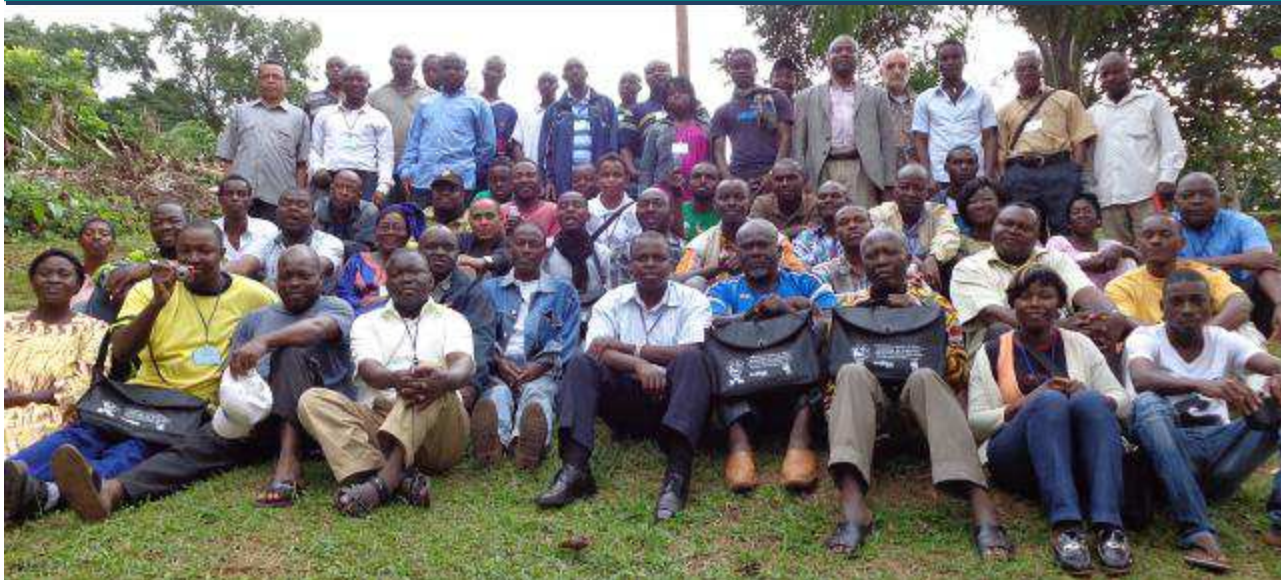
Participants in the Training Session of RELAF Bursars

Douala District hosted a training workshop for RELAF Bursars and their Collaborators. This training Session is part of the ongoing Formation for Personnel and Managers of Centres and Apostolates of the De La Salle Brothers in RELAF.