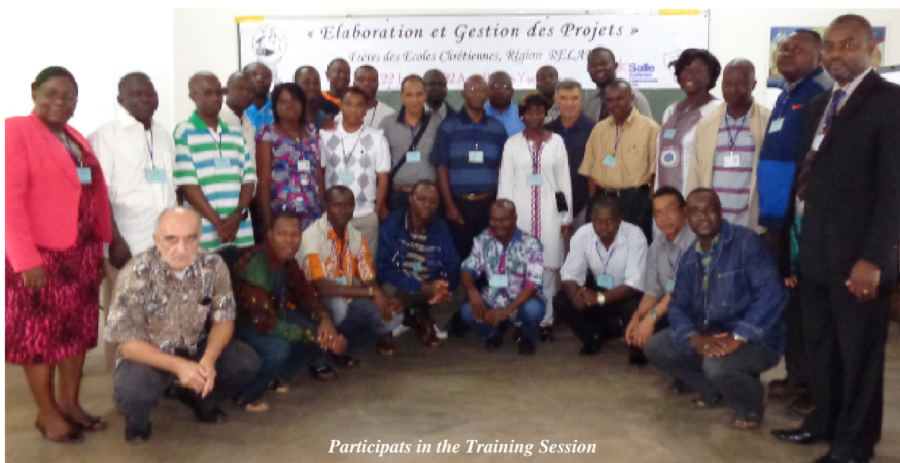
Participants in the Training Session