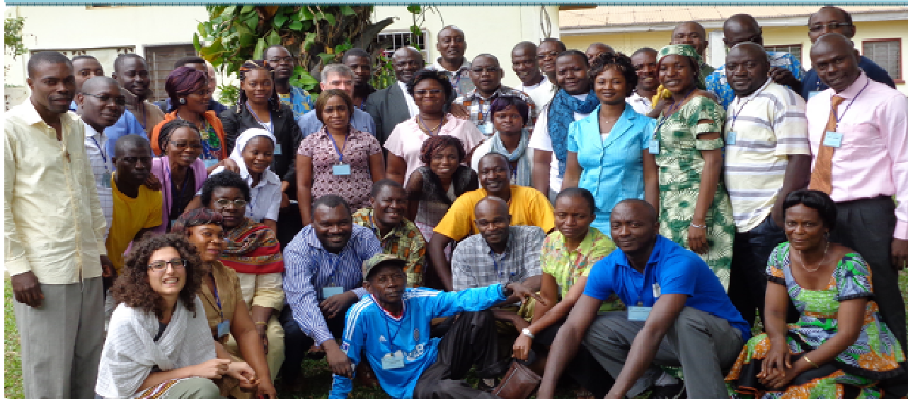
Participants at the Training Session on Child Protection

To allow each work to implement its own policy of prevention and protection of children's rights, the District of Douala held a training session on Child Protection from July 29 to 03 August 2013 Okola near Yaounde.