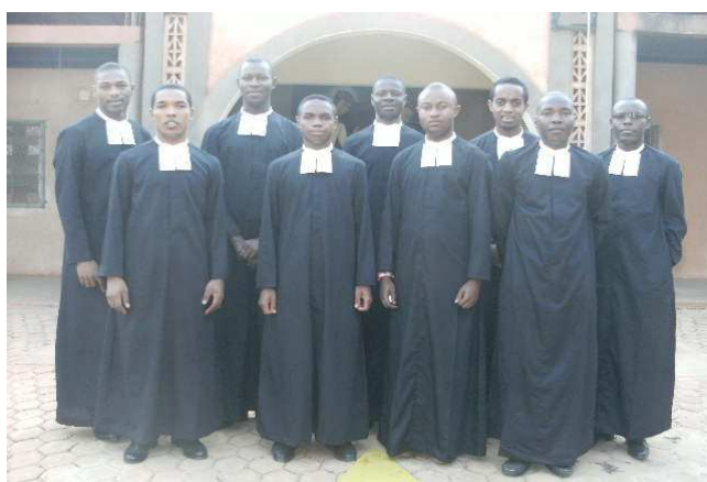
Novices (First year ) Saint Josemaria Escriva

At the end of the celebration, the new novices were welcomed by fraternal accolades from Brothers. After the celebration, the novitiate community shared a fraternal meal with guests with great joy and happiness.