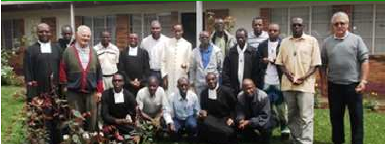
Brothers of Rwanda Delegation with the retreat preacher.

The retreat took place from December 1 to 6 2013. At the end of the year dedicated to Faith and the beginning of the pastoral year, the Brothers chose to meditate on the theme " Rooted in faith in Jesus Christ for a better apostolate. "