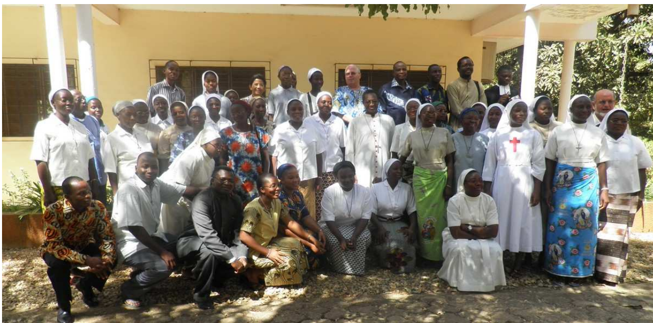
Participants at the trainin session of Accompanying persons.

And the psychological dimension of the life of the accompanying persons made us explore the multidimensionality of the human being, the importance of a just self-esteem, the need for good communication and good attitudes for successful accompaniment.