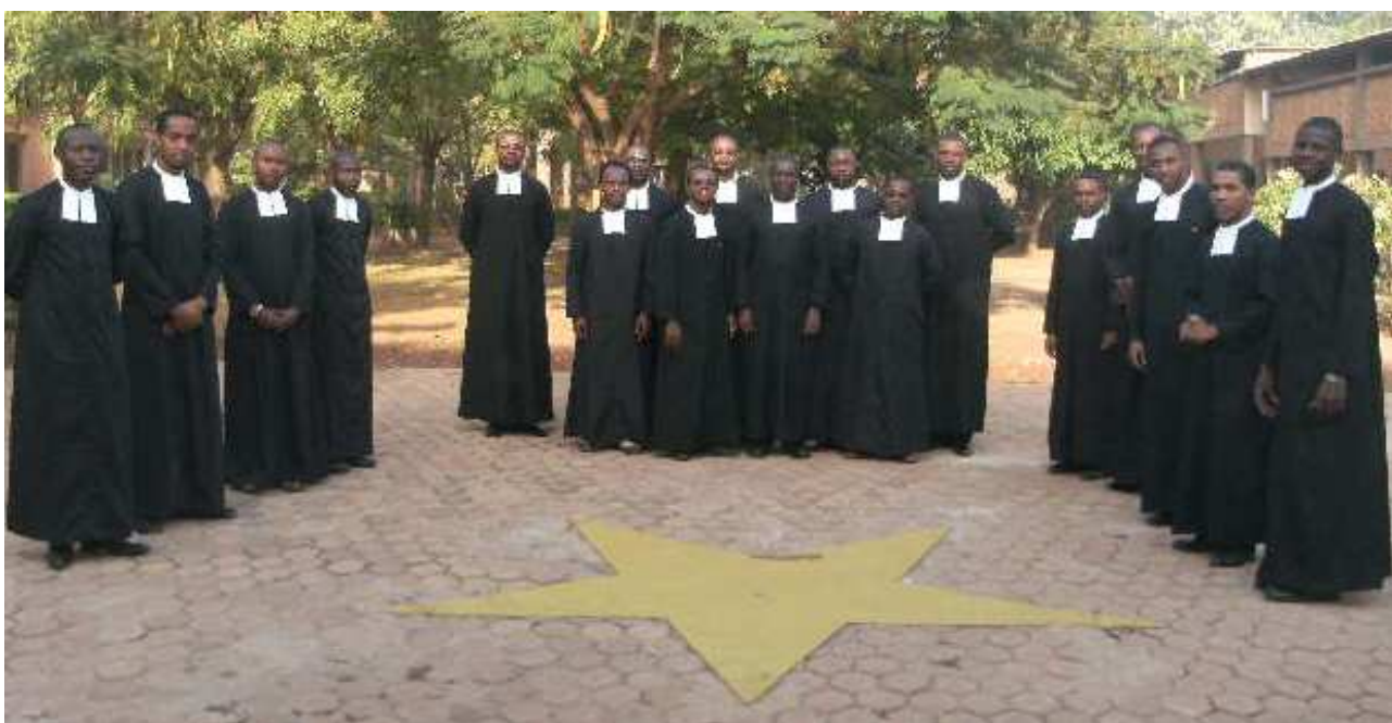
Novice Brothers ( 1st and 2nd year of formation) - 2013-2014