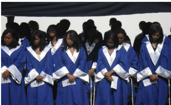
La 20ème Promotion "NI-AVO" - Infocentre De La Salle

For the occasion, they wore a very distinctive and classy outfits: blue—white with their hairdressing