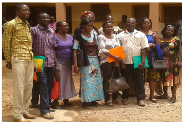
La Salle Badenya group