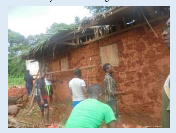
May each Brother continue to work more to reach out to the young and to be with them.

It was a special camp because it had been six (6) years since 2013in Diang when the District last organized a vocational camp. Moreover, what makes this Vocational Camp special is that, among the 13 young participants, 8 of them have applied for admission either for the Pre-postulancy; or for the Postulancy. The Lord wrought marvels for us!