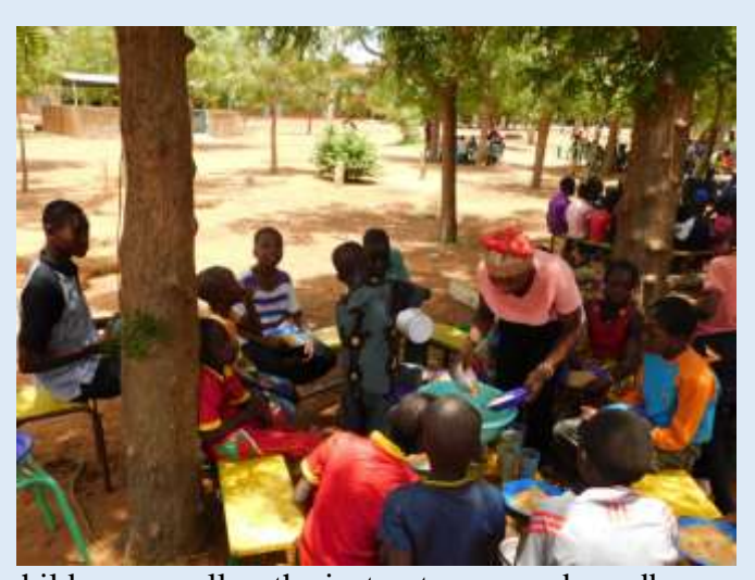
children as well as the instructors waved goodbye to each other, until they meet again for the 2020 edition!

On the day of 21 July, Brother Josué, Director of the CLEF, summoned the instructors for a general clean up and evaluation.